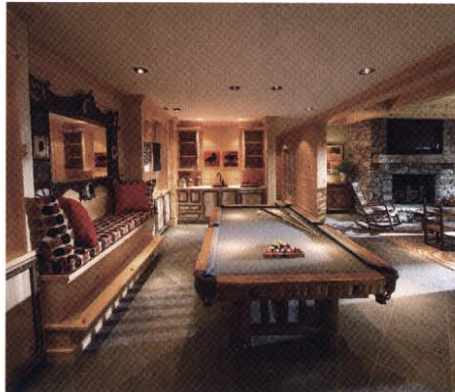
The billiards table is a part of the downstairs family room in the HGTV Dream Home.