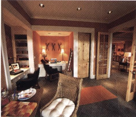
A project room with plenty of counter space and cubbies for everyone in the family.

second time in three years. Grey Rock at Lake Lure, one of the most exclusive luxury mountain-living