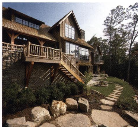
The back of the HGTV Dream Home.

Located on the second floor, or the main floor, the heart of the home is actually outside. The outdoor living room/dining room, known as a dogtrot, features an enormous outdoor fireplace and connects the main house to the guest quarters. The second-floor interior is occupied by the living room, whose decor deeply reflects its North Carolina heritage. Off the living room, a kitchen with a beautiful breakfast nook is full of state-of-the-art appliances and custom-made countertops and cabinets. The master bedroom is connected to the master bathroom, complete with a magnificent walk-in shower and Jacuzzi tub. The main floor also